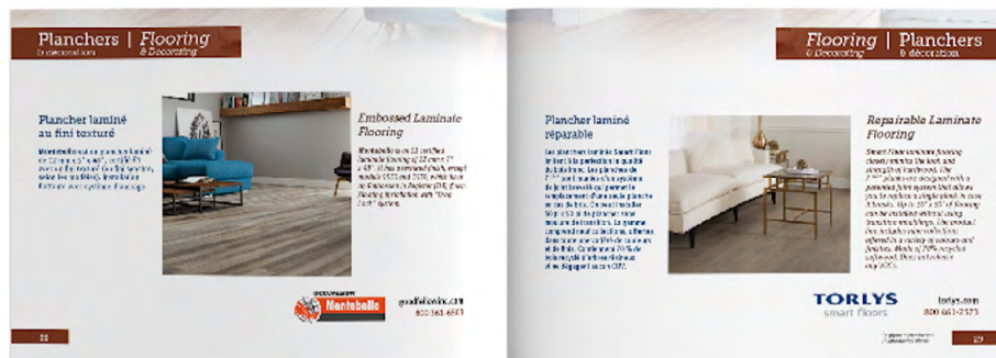
Example of products in Flooring & Decorating Section