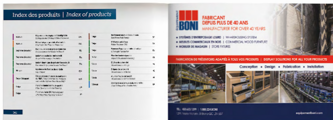
Example of a full page ad