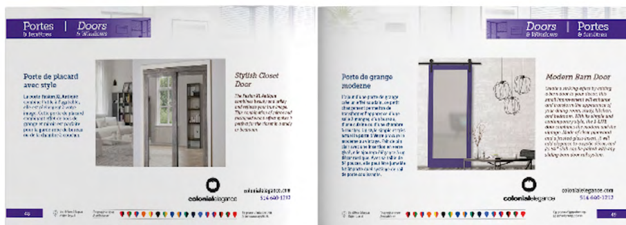
Example of products in Doors & Windows Section