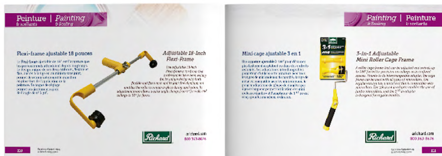
Example of products in Painting & Sealing Section